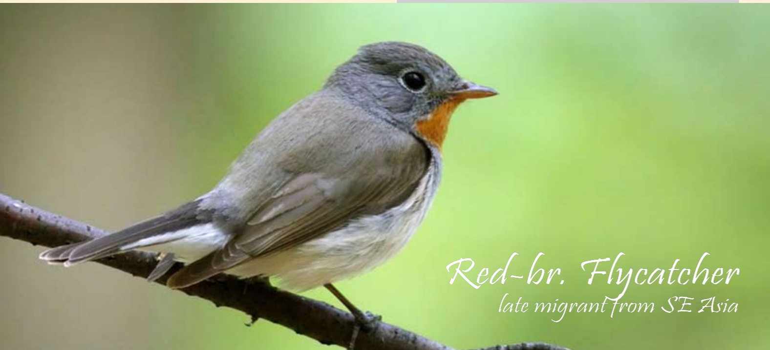
Red-br. Flycatcher late migrant from SE Asia