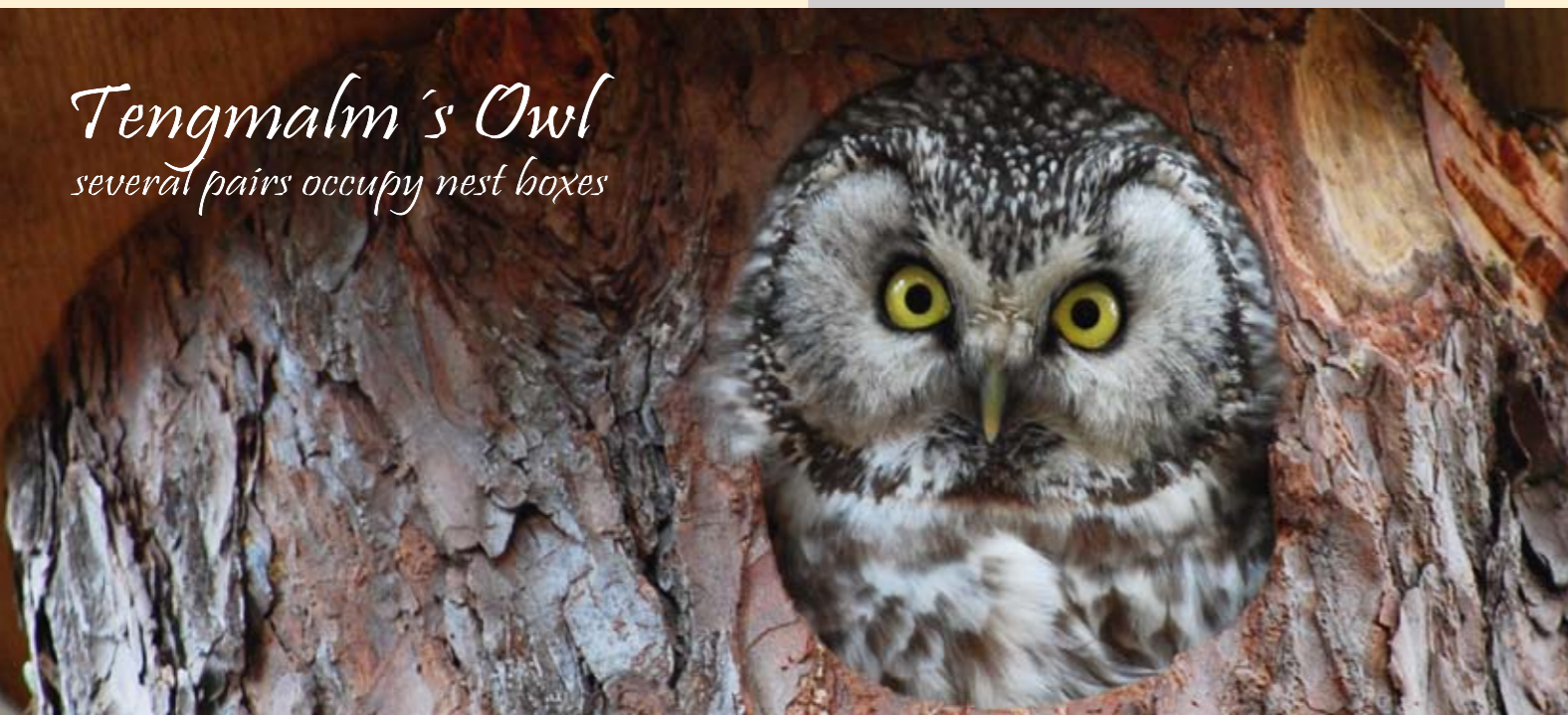
Tengmalm's Owl several pairs occupy nest boxes