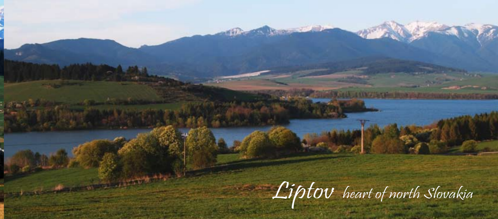
Liptov heart of north Slovakia