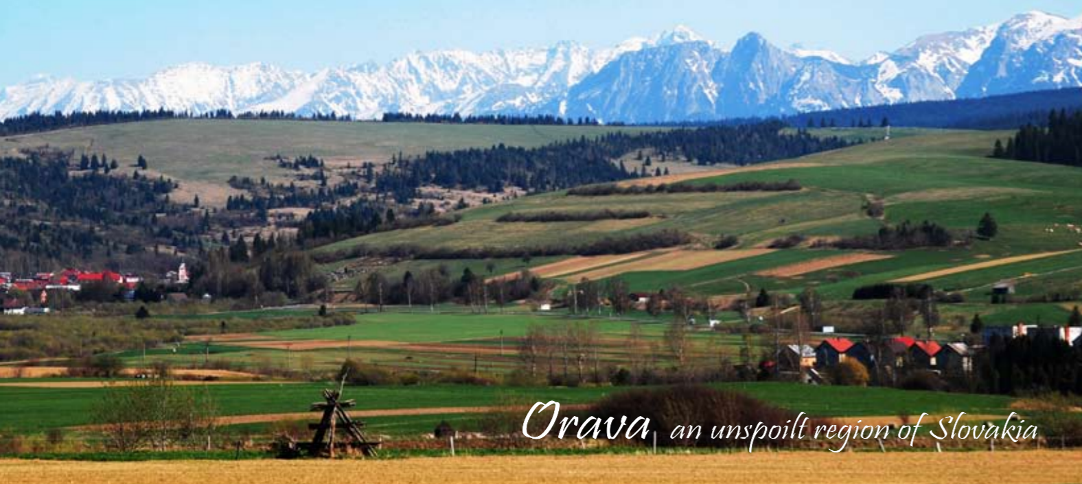
Orava, an unspoilt region of Slovakia