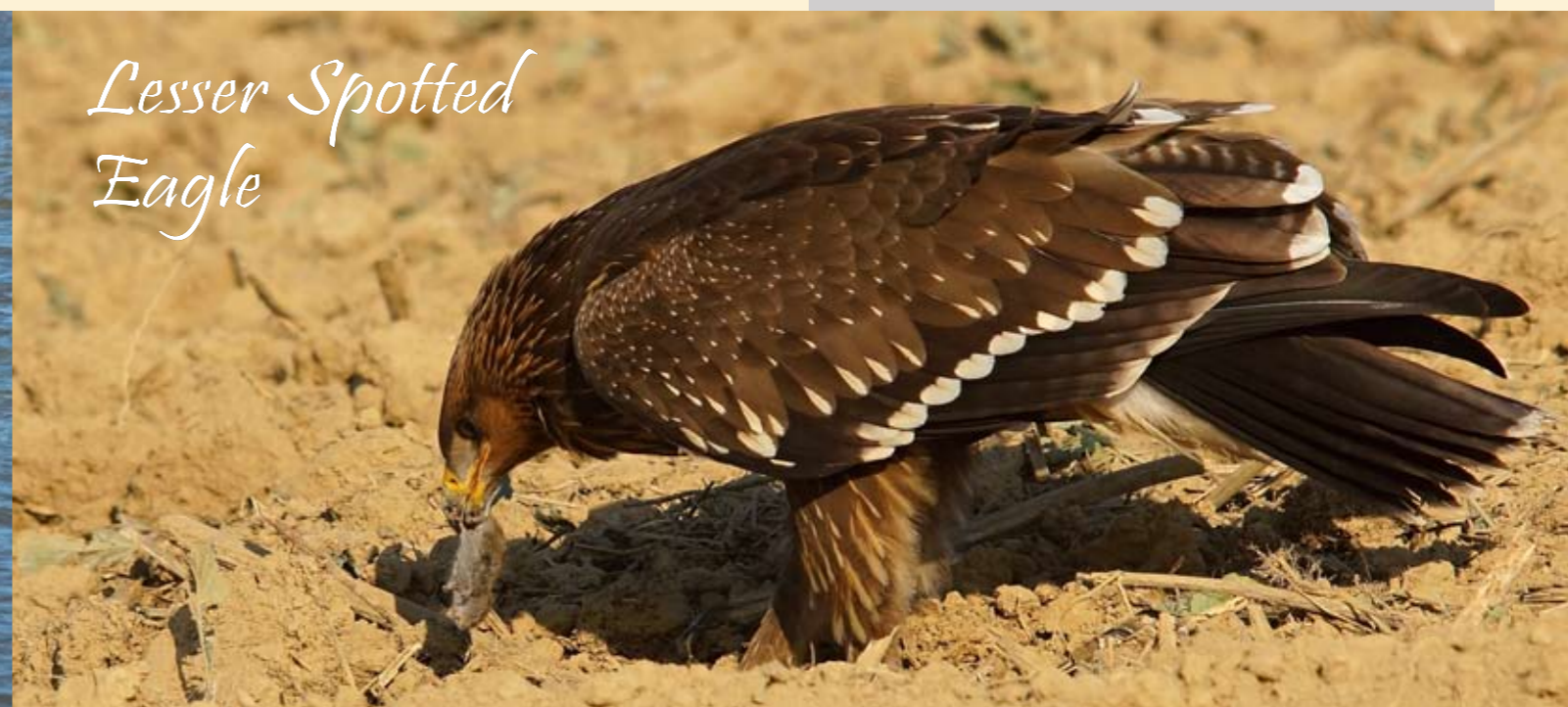
Lesser Spotted Eagle