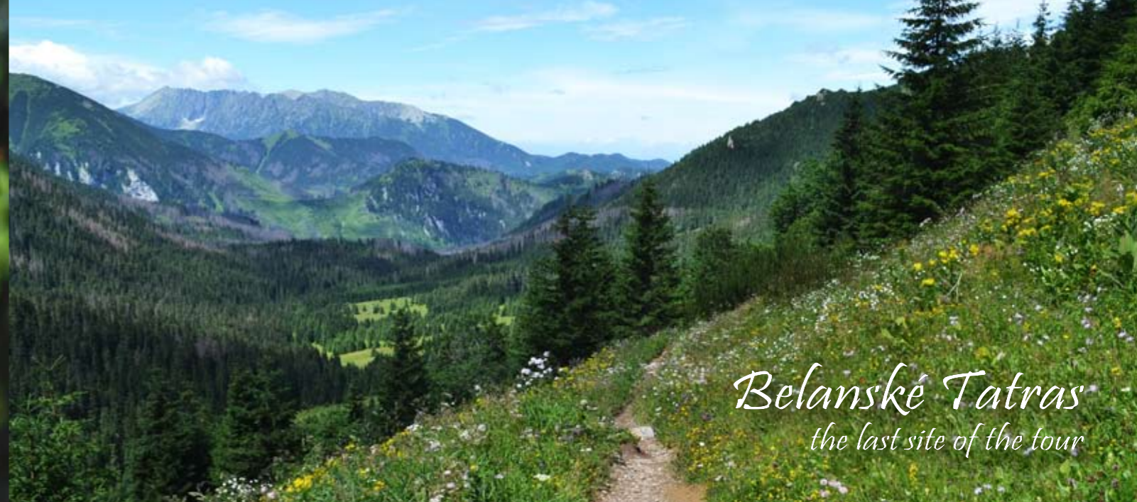
Belianske Tatras the last site of the tour