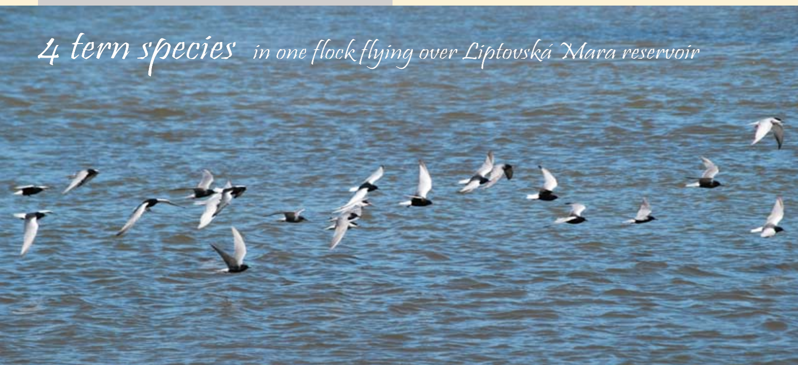
4 tern species in one flock flying over Liptovská Mara reservoir

Travelling will be comfortable, distances driven short and we can keep you busy all through the day if you wish.