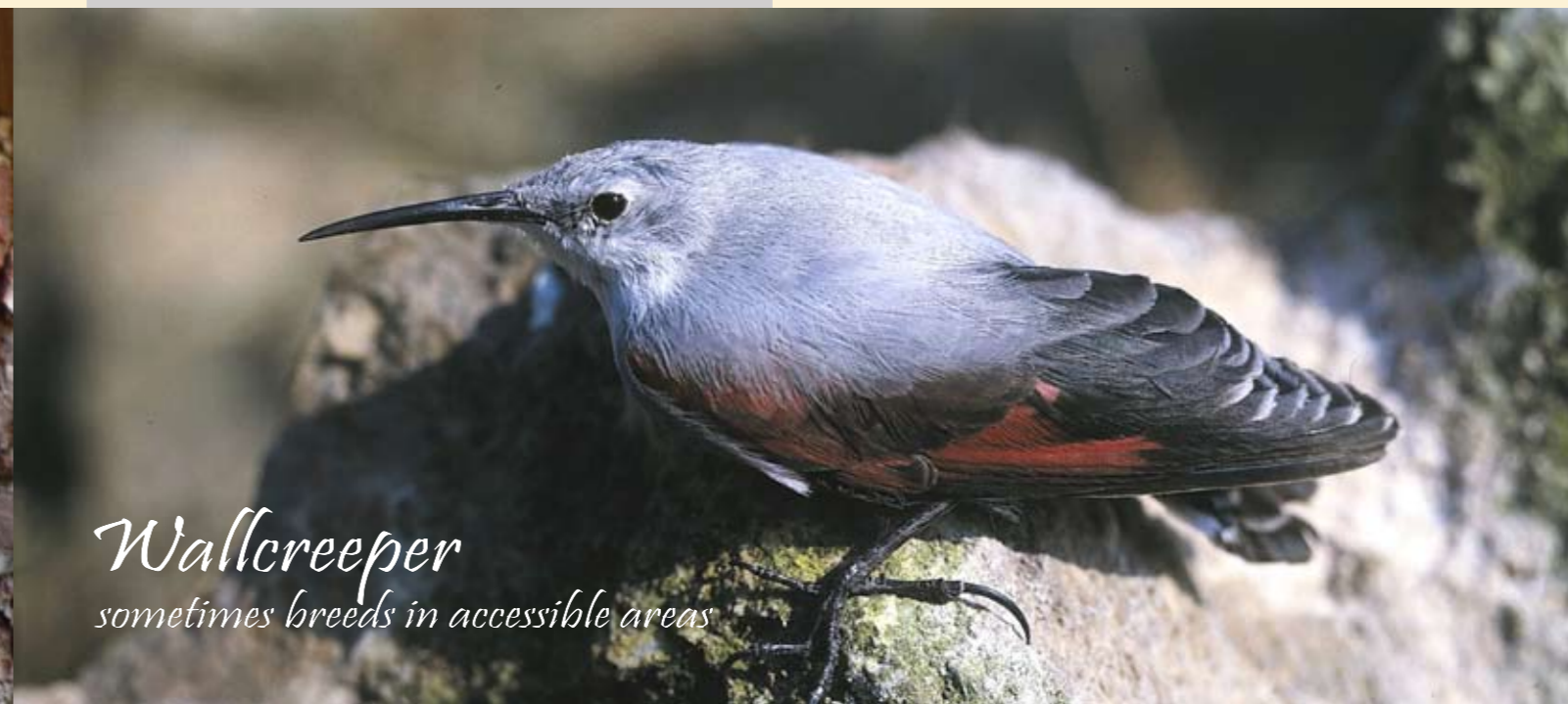
Wallcreeper sometimes breeds in accessible areas