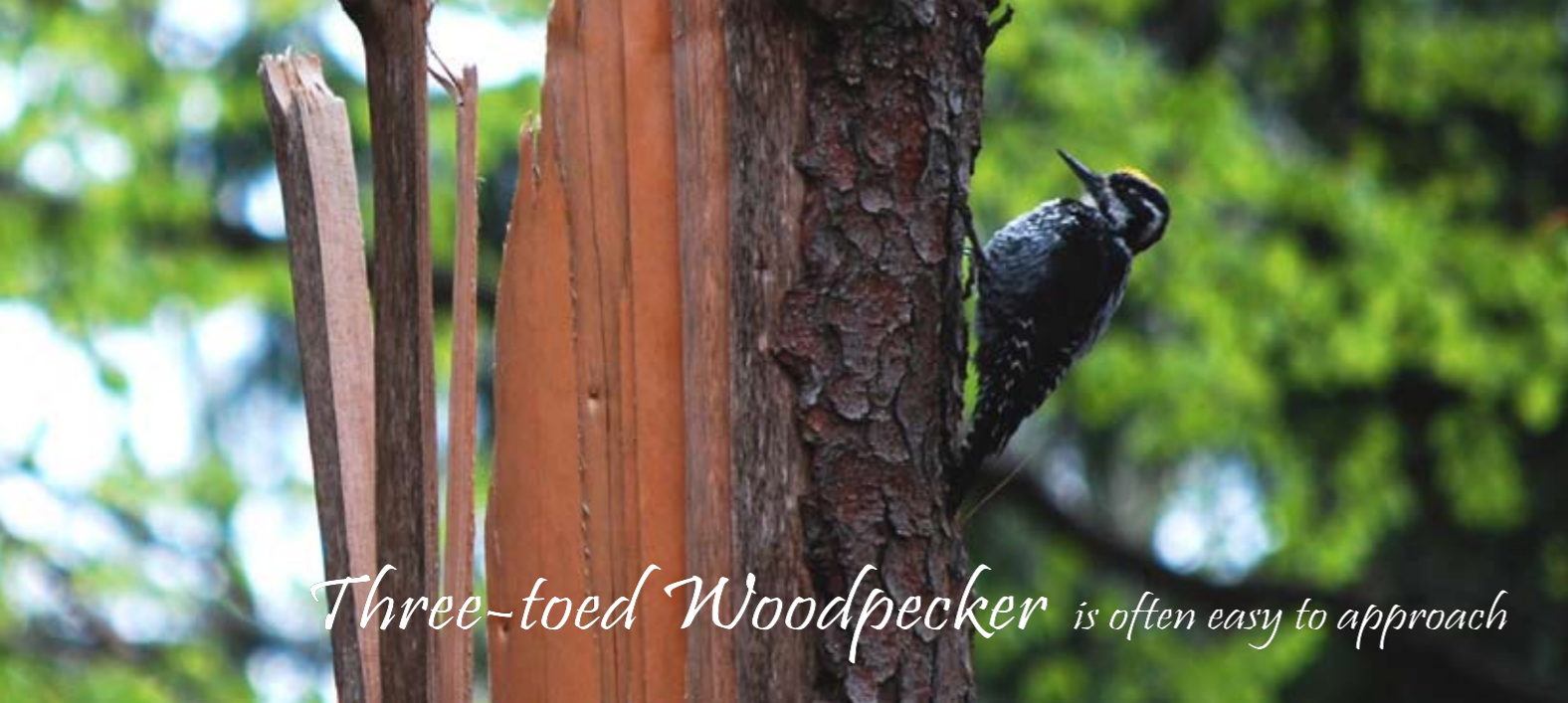
Three-toed Woodpecker is often easy to approach